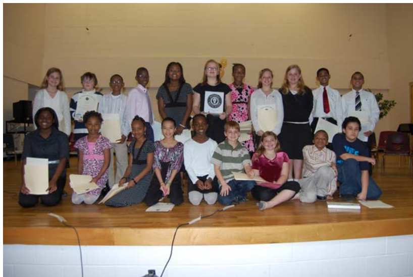
West Elementary Beta Pictured top from left to right

The purpose of the National Beta Club shall be to promote the ideals of character, service and leadership among elementary and secondary school students, to reward meritorious achievement and to encourage and assist students in continuing their education after high school.